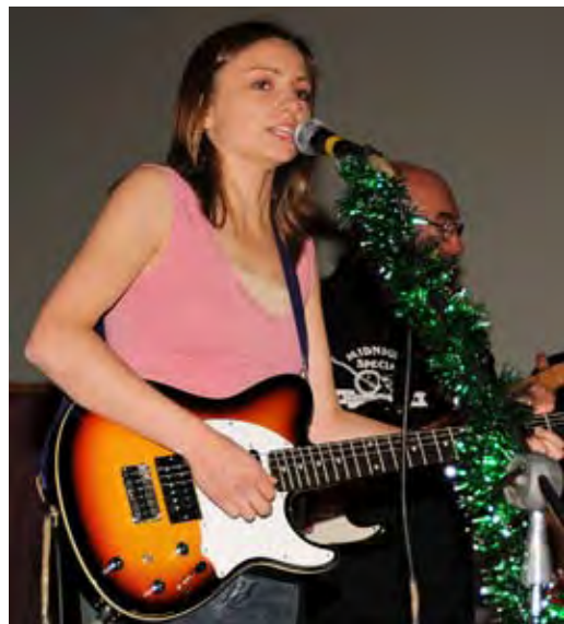
Mahalia complete with tinsel decorated microphone stand

Ian Fisk (Lorraine liked most of the above that appeared in SACCM January Prelude and said to use it!)