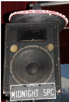
Interesting Hat rack!