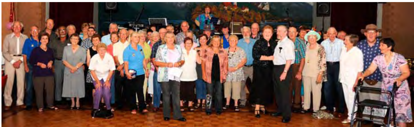
Many of the early members of the Adelaide Country Music Club