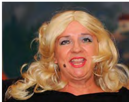
Di at our February Show

The love of money is the root of all evil.