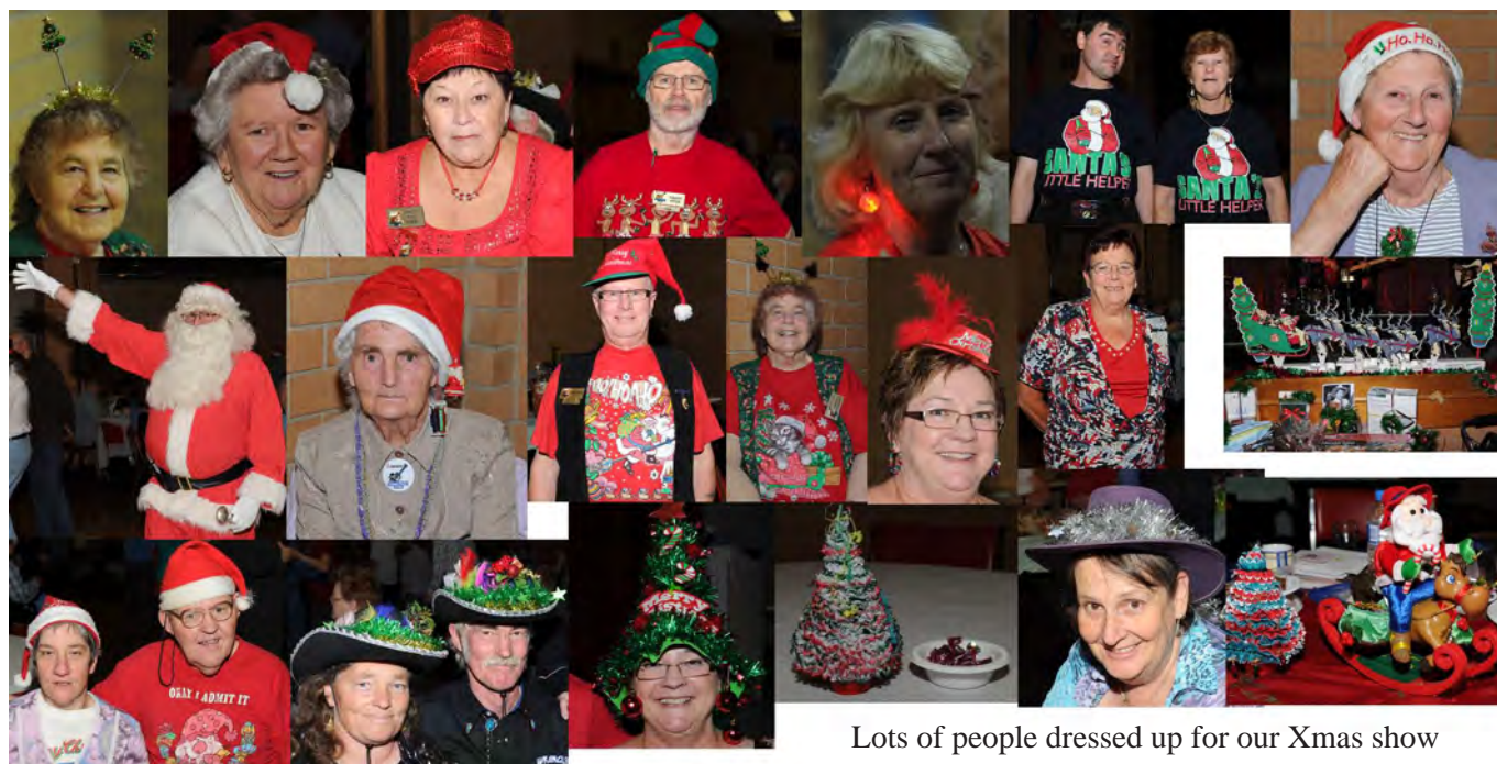
Lots of people dressed up for our Xmas show